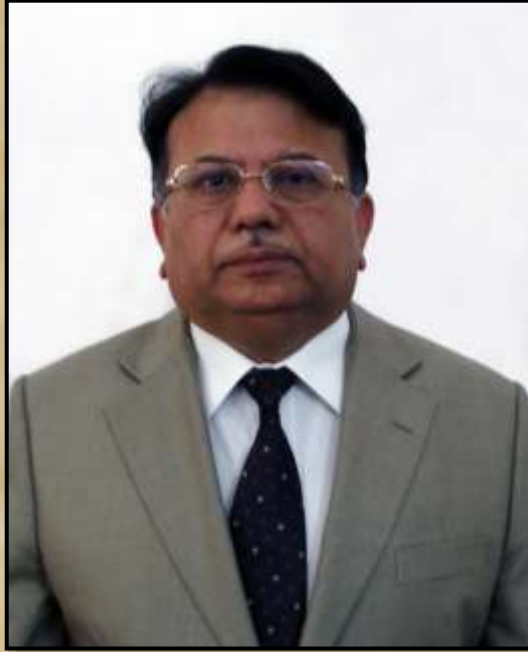
Justice Ajit Prakash Shah CHAIRMAN SPRINGDALES SCHOOL, PUSA ROAD